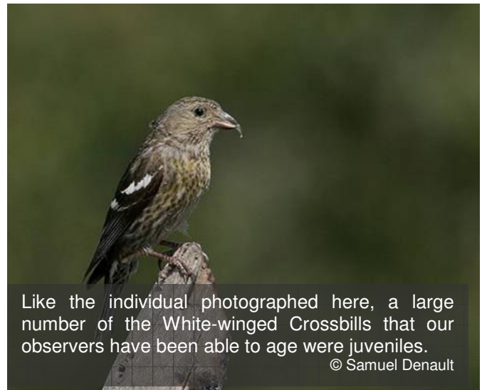
Like the individual photographed here, a large number of the White-winged Crossbills that our observers have been able to age were juveniles.